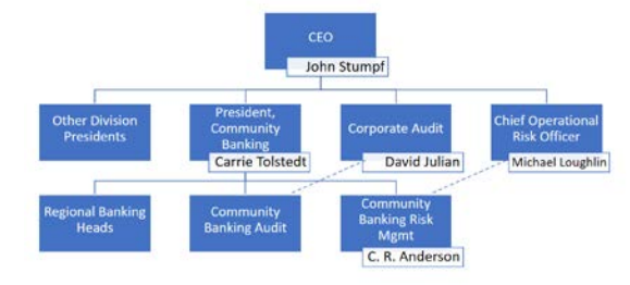
Figure 1. Wells Fargo Organization Chart (Wells Fargo Reports, as of September 2016)

Wells Fargo's organization structure, particularly related to the Community Bank, is shown in Figure 1. Note that