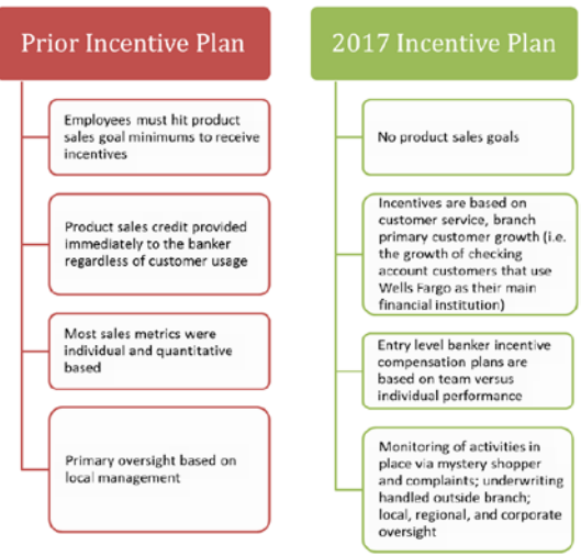
Figure 4. Wells Fargo Incentive Metrics Compared (Wells Fargo, 2017)

In January of 2017, Wells Fargo announced their new metrics and incentives program which eliminated specific sales quotas. The incentives also focused on customer satisfaction, was more team-based (at least for entry-level staff), and carried more of an oversight function to ensure proper behavior. Wells Fargo hoped that this new incentive program would encourage the correct behaviors while discouraging the bad behaviors that precipitated the scandal.