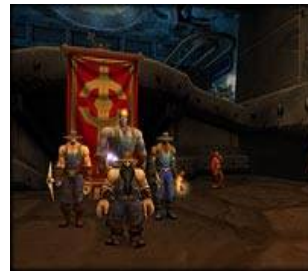
Figure 4. World of Warcraft

Ragnarok (Figure 3) is a Massively Multiplayer Online Game based on Norse mythology and the Korean graphic series with the same name written by Myung-Jin Lee. Users can create characters and venture off alone or in groups in far-flung fantasy worlds full of adventure. The game deals with quests for treasured parts, when collected they increase the player's powers in game. The graphical design of the environments has been inspired by mythological and historical elements from various cultures around the world. Furthermore, it features hand-drawn, Japanese-style rendered characters in realistic 3D backgrounds. Character development is provided through character levels to allow for stats adjustments, while job levels let players pick new skills that depend on the player's job class.