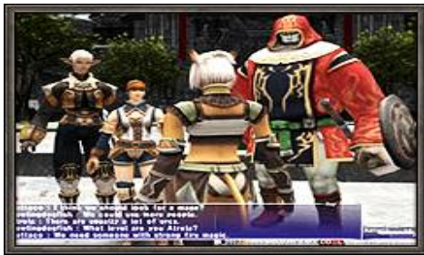
Figure 5. Final Fantasy XI

Likewise, Final Fantasy (Figure 5) lets player assume roles (they are called jobs in the game), which can be changed throughout game play. Furthermore, players may also seek a secondary role at any time, but jobs that are more exciting are only available for players with a certain level of experience. Players can be assigned quests, missions, and conquests that will increase their individual reputation, as well as the influence of their respective nations. It encourages collaboration and team formation as parties has more chances of surviving than a single individual exploring on his or her own.