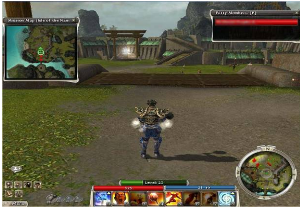
Figure 2. GuildWars