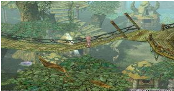
Figure 3. Ragnarok