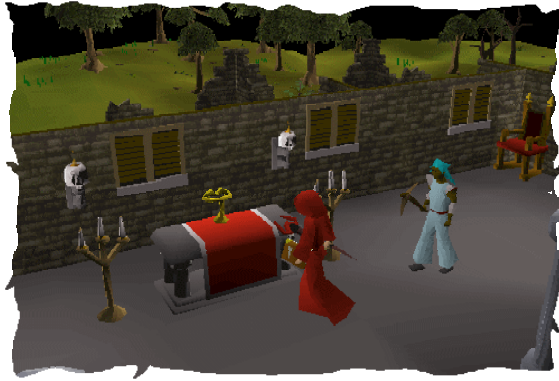
Figure 1. RuneScape

were several interesting games, but we decided to download and play two of them.